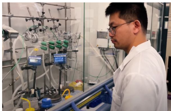
Link to the video