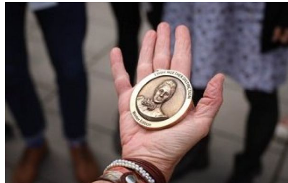
Emmy Noether Distinction Medal