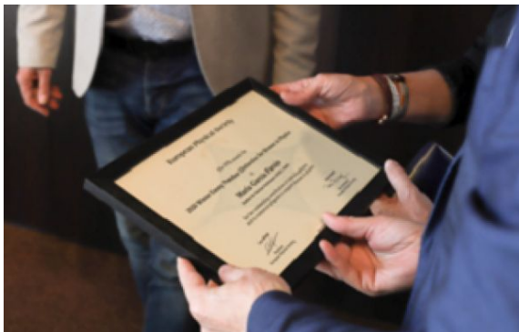
Emmy Noether Distinction Plaque