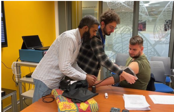
Participants testing the Medical Optics devices.