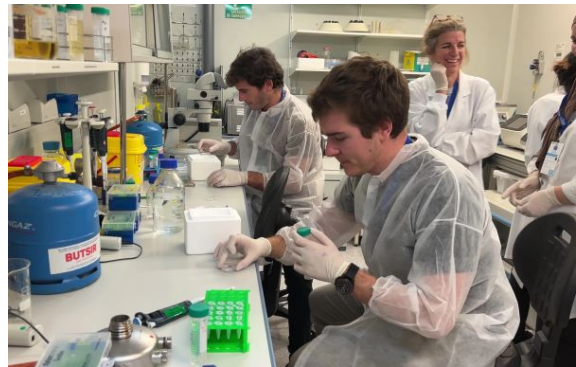
Participants working at the Biolab.