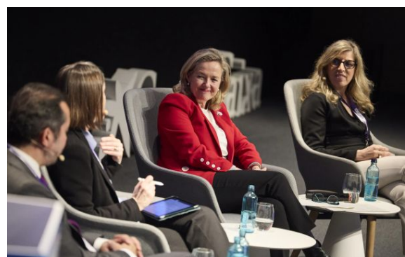
'Conditions for Frontier Research to Shape the New Industry' roundtable